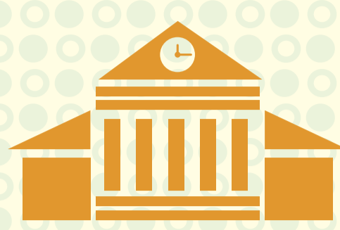
Colleges and career schools